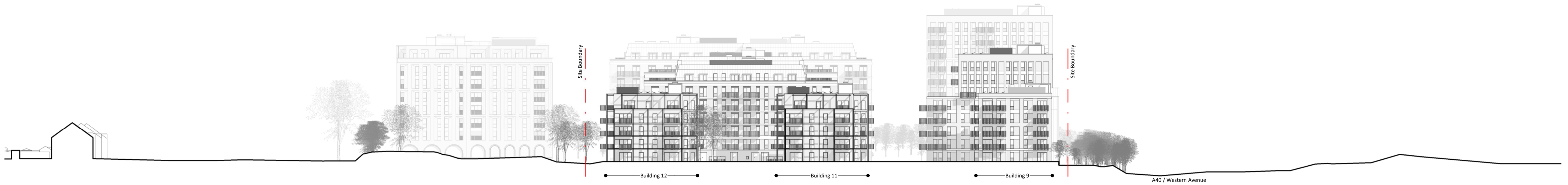
1 Site Elevation - East 1 : 500